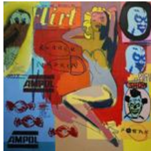
'Candyland' JOHNNY ROMEO