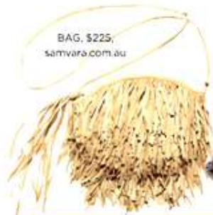
BAG, $225, samvara.com.au

One of the joys of working at CLEO is witnessing the many micro-trends being paraded through our doors. Here are some of our current treasures.