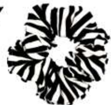
SCRUNCHIE, $12, americanapparel.com.au